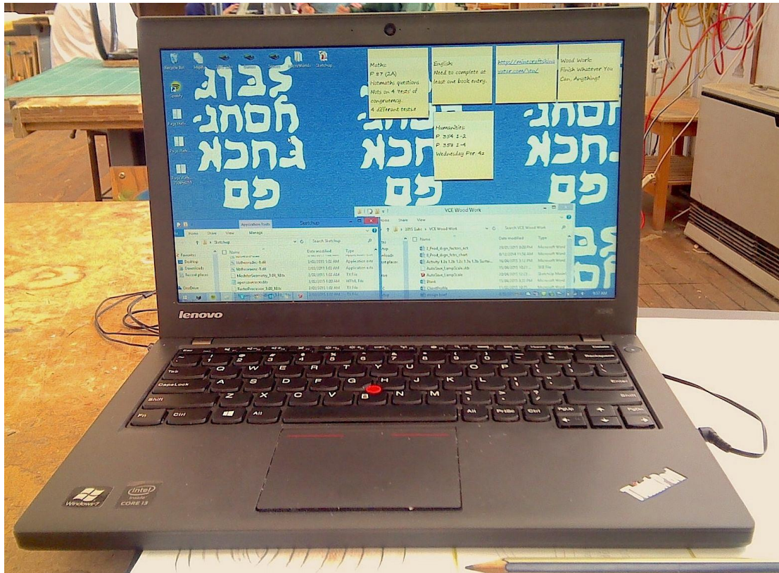
Figure seven. Year Eleven student device displaying self-designed wallpaper, school reminder notes and various open windows (Lakeside)

Device-related tensions were also apparent between students the schools’ technical staff. These issues were not manifest during class times but were of concern for the schools’ technical staff who tended to be tucked away in window-less rooms in far-flung sectors of the school campuses. These staff were responsible for a range of technology-related work within the schools, including maintenance of hardware and software infrastructures, ensuring that school networks were running, monitoring use of school systems and generally ensuring that IT functioned. The influx of student devices had undoubtedly complicated the work of technical staff in the three schools. In particular IT technicians (only a few individuals in each school) had become inundated with students wanting personal devices maintained and fixed.