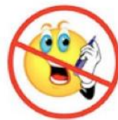
Figure Four: School efforts to curtail parental use of phones and other devices to engage with students (Mountview newsletter August 2015, Middleborough newsletter April 2016)

It is important for students to remember that mobile phones are not to be brought to class. Mobile phones need to be kept in lockers and only used before school, snack time, lunchtime and after school.